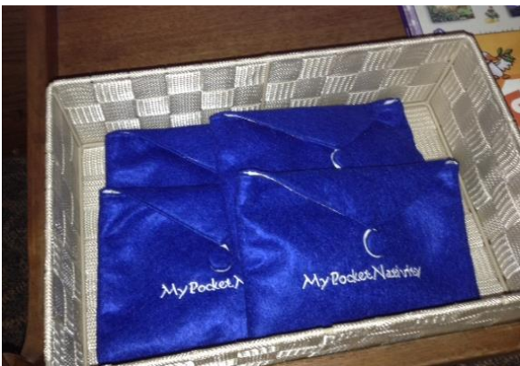
Pocket Nativities available thru Cokesbury.