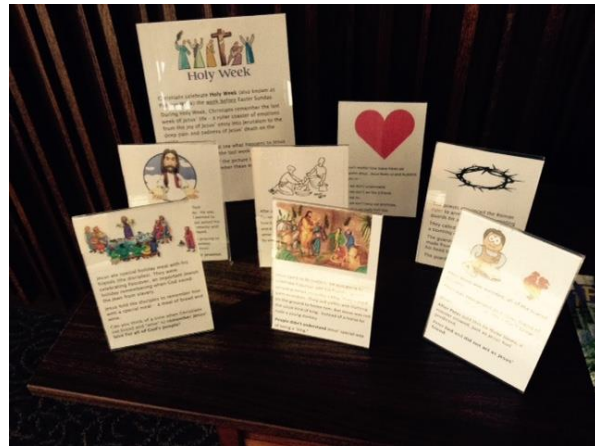
Holy Week – pictures and descriptions of the days to put in order.