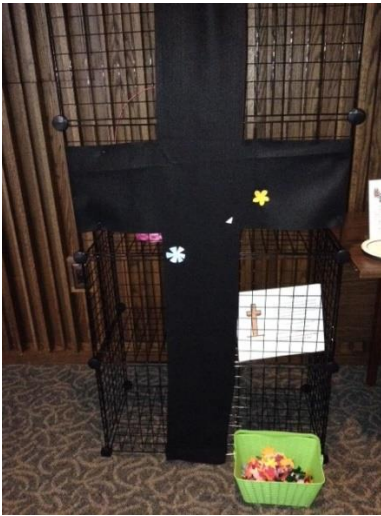
Easter cross to add flowers.