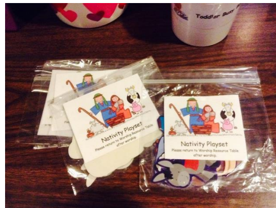
I laminated leftover advent calendar stickers and put them in sets.